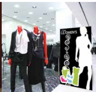
In-store communication – forex