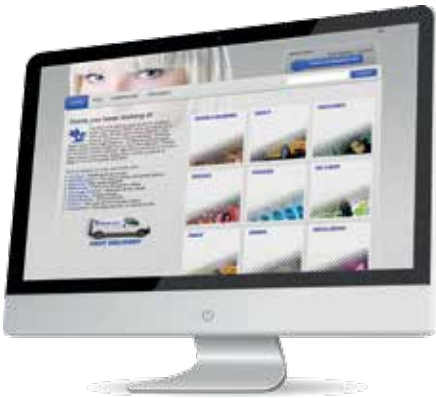
StoreFront web-to-print software

The Asanti GUI works with improved visualization of the job layout and positioning: operators can see exactly what they are printing. The GUI offers access to key print parameters to make sure any last-minute changes are quick and easy to apply. Job preparation takes place independently from the Anapurna operation due to the client-server infrastructure. This complements the autonomy of the machine beautifully; ensuring operators are not tied to the printer when other tasks demand their attention.