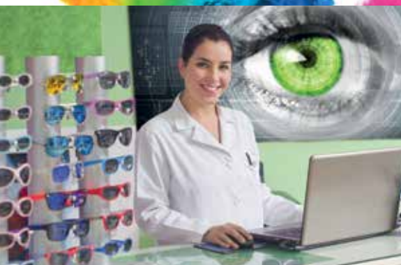
In-store communication – paper