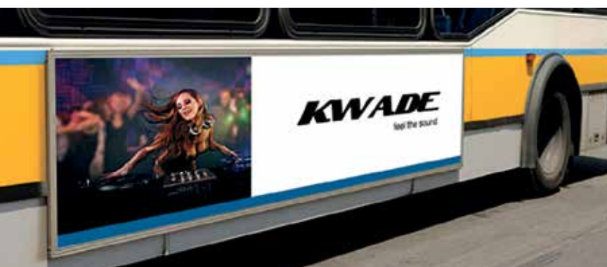
Outdoor communication – vinyl