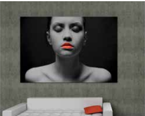
In-house decoration – dibond

As a highly-advanced printer powered by Asanti, the Anapurna FB2540i LED integrates perfectly with PrintSphere, Agfa Graphics' cloud-based service for production automation, easy file sharing and safe data storage. This integrable cloud service offers a standardized way for print service providers to automate their workflows and facilitate data exchange with customers, colleagues, freelancers, other departments and other Agfa solutions.