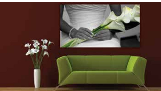
In-house decoration – dibond