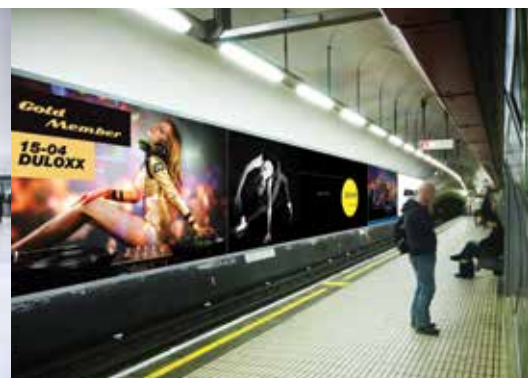
Outdoor communication – vinyl