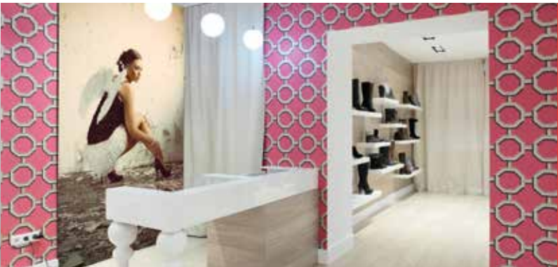
In-store communication – forex