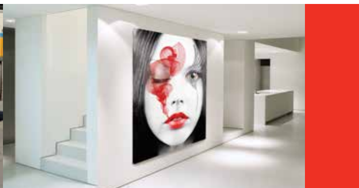
In-house communication – dibond