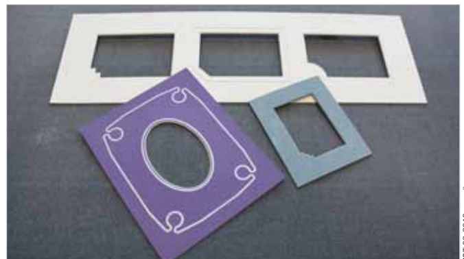
Application: cut mats for picture framing.